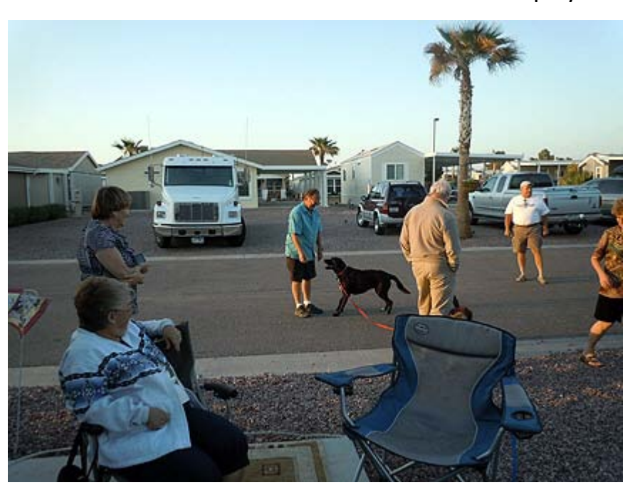
Some of the guests went home and it was getting cool, so we moved inside.