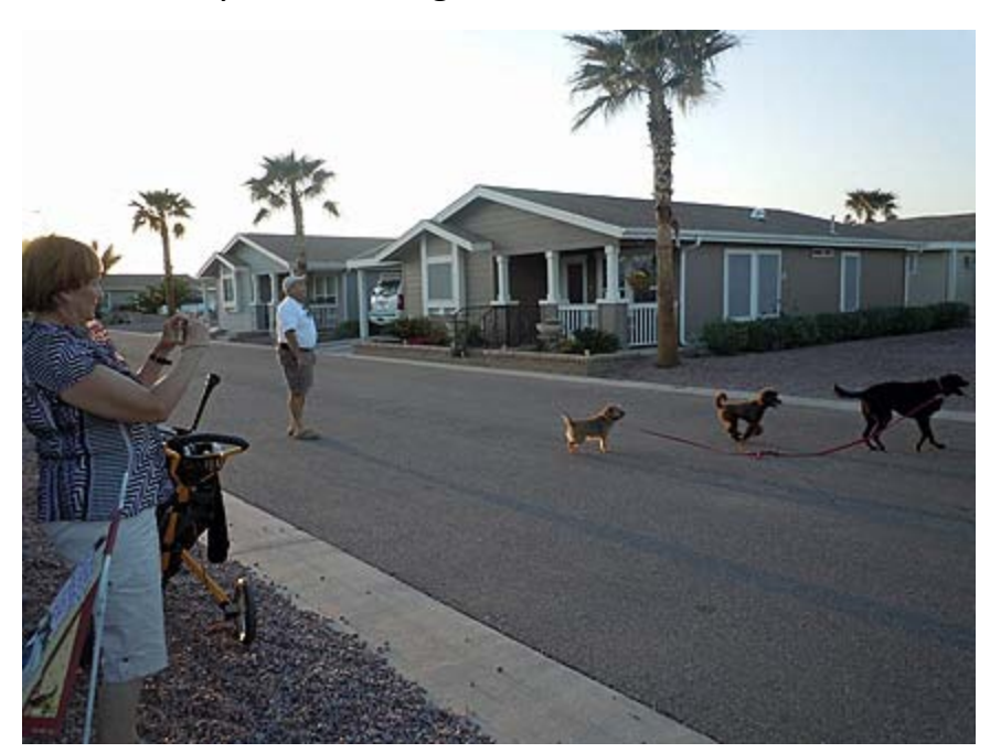
This is how we play ball

The rules say that the dogs have to be on a leash.