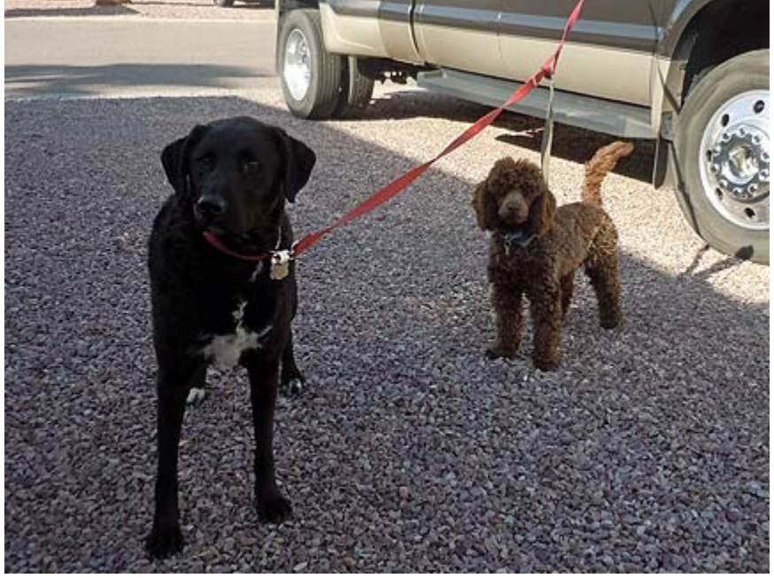
Mocha and Indee "In Jail"