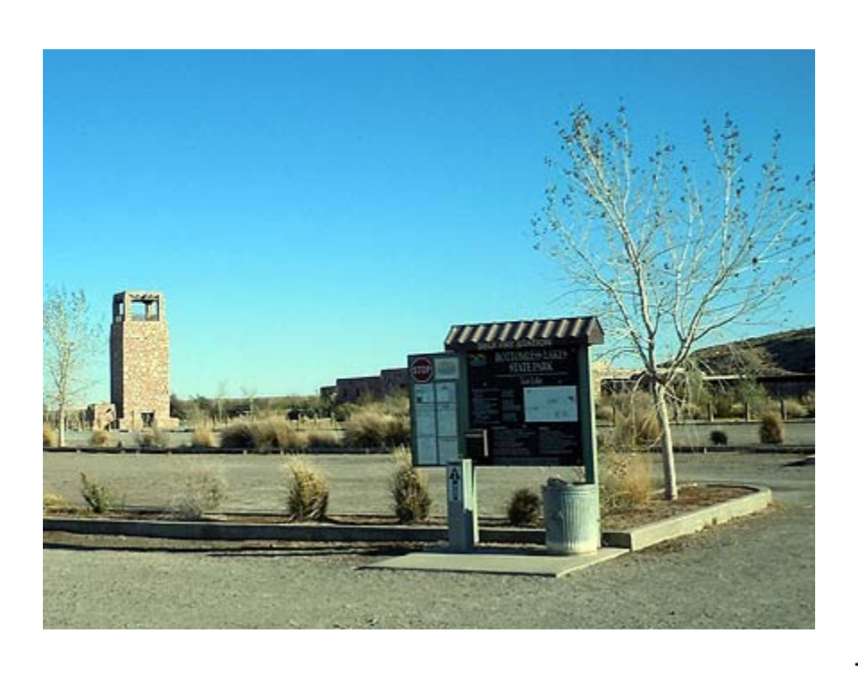
This was our campsite