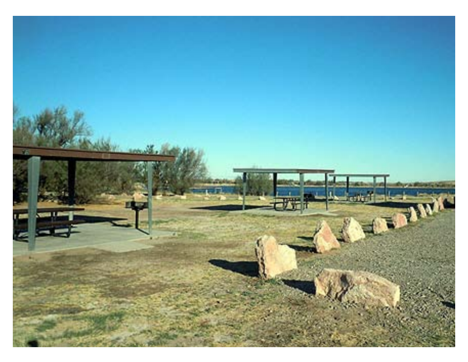
There was a pavilion next door that made an excellent place to play ball with the dogs.