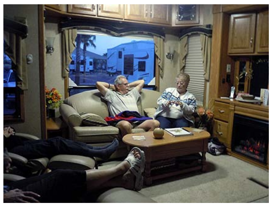
Thanks to everyone who came to the party. You all made it so very special!