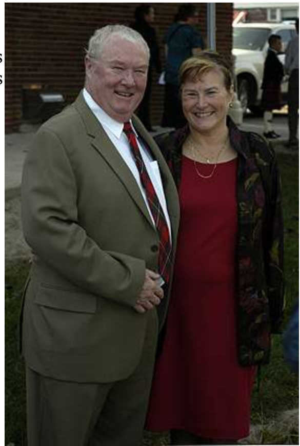
The groom's happy parents