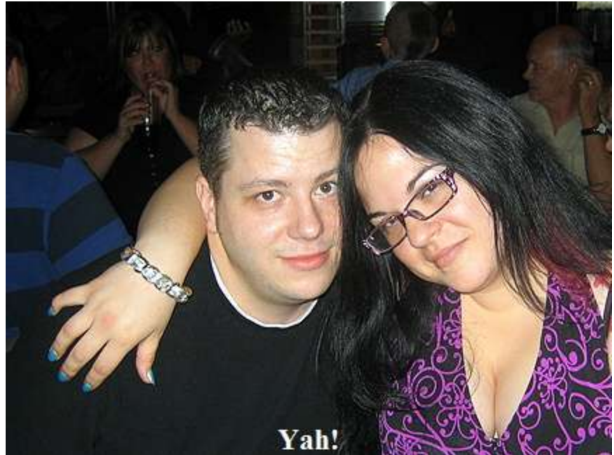
Some people ate so much that they got a little silly