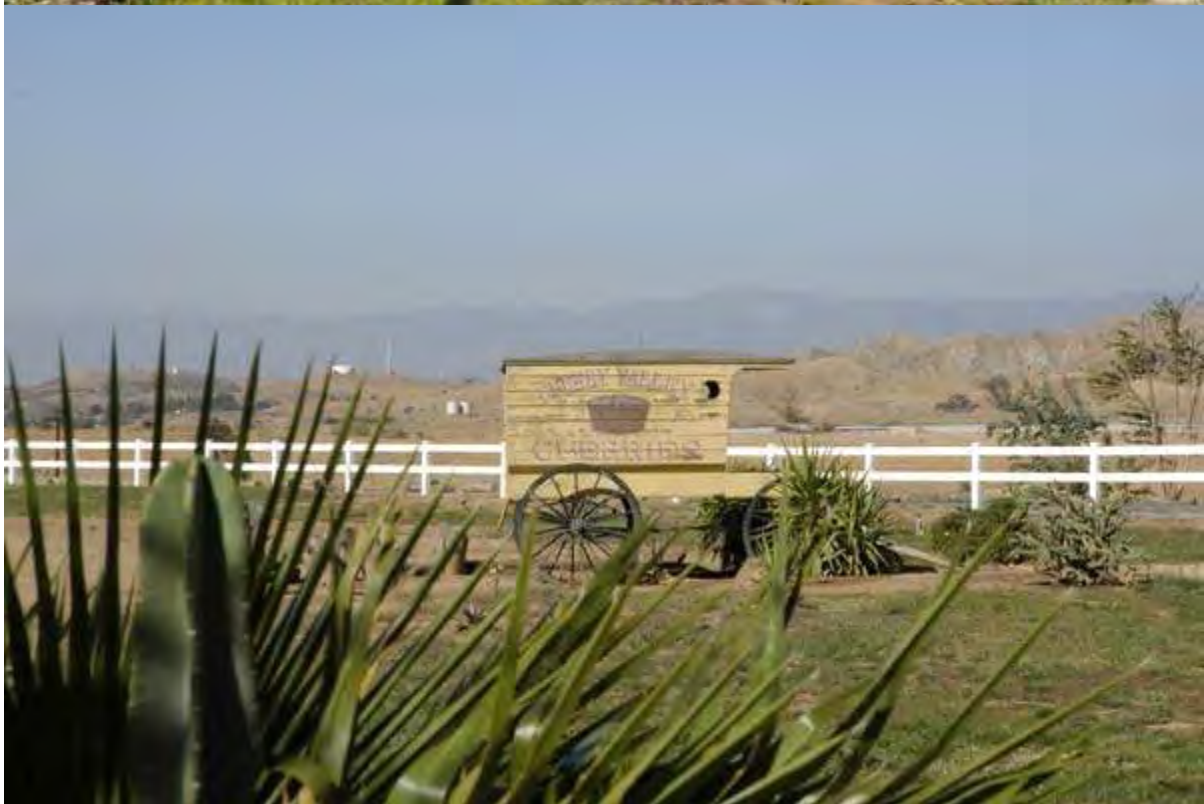
Around the park there are various wagons. Mike & Percy tried one out for size but soon decided to make a run for the hills.