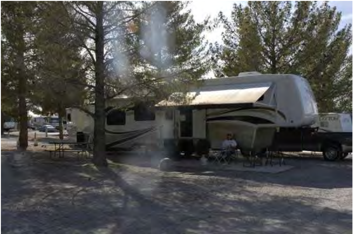
Another Great Site - Maureen got some sun

We didn't do very much today - just took a few walks and enjoyed the weather and the scenery of the campsite. Here's a look: