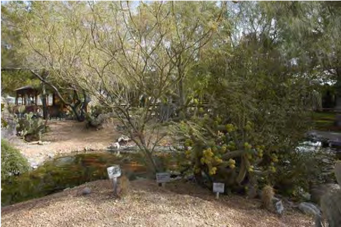
Another Garden to relax around.