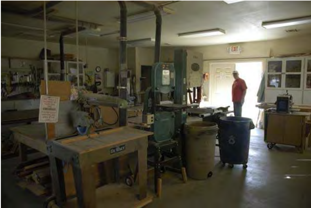
The Work Shop!