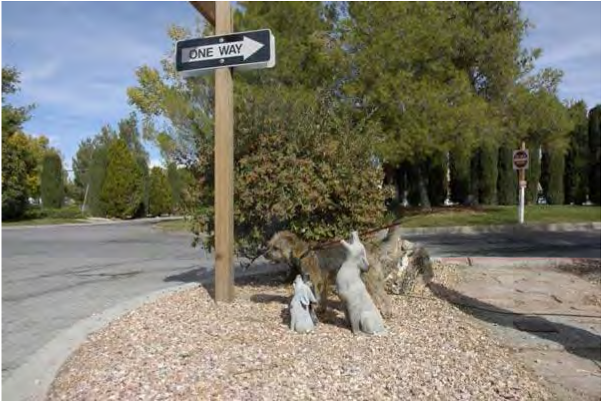
Percy having a howling good time!