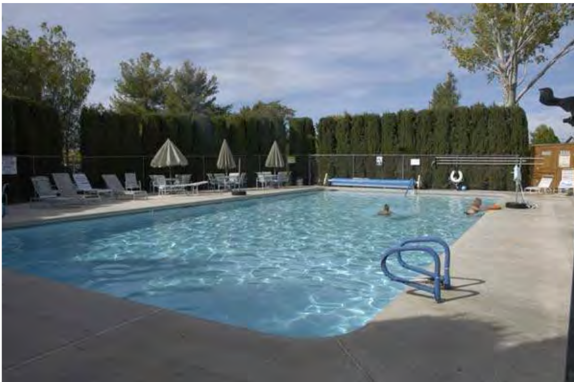
And we don't have to clean it!