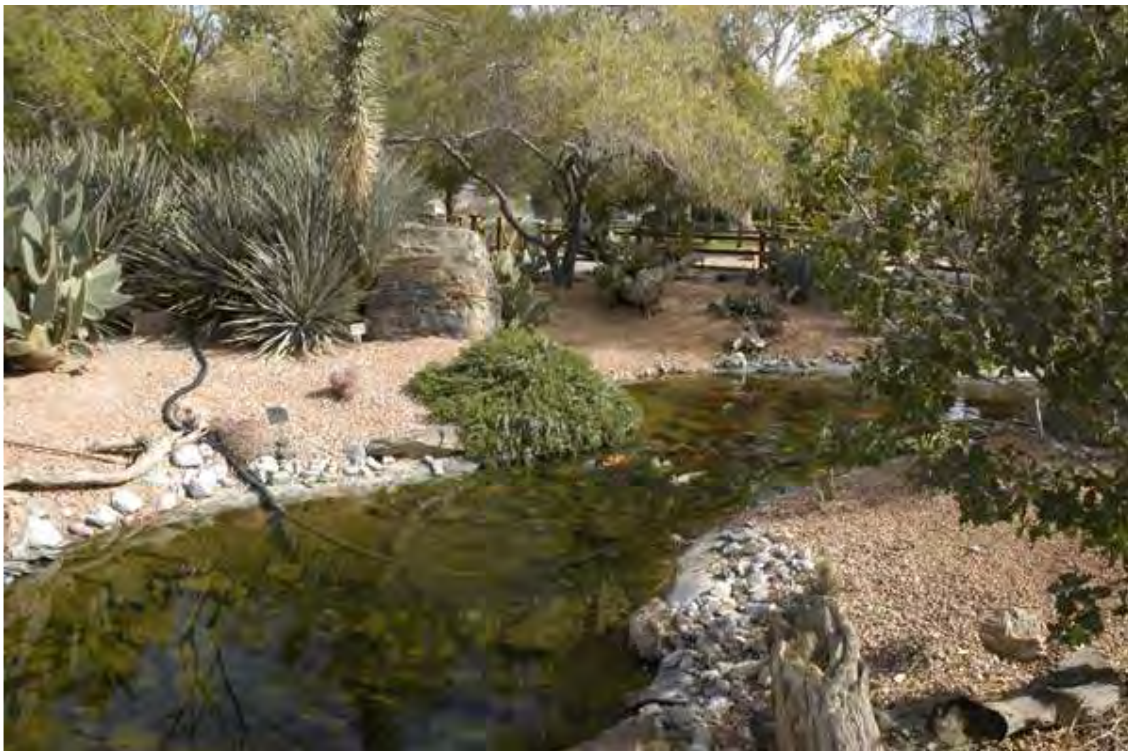
Hum.... Goldfish in the desert?