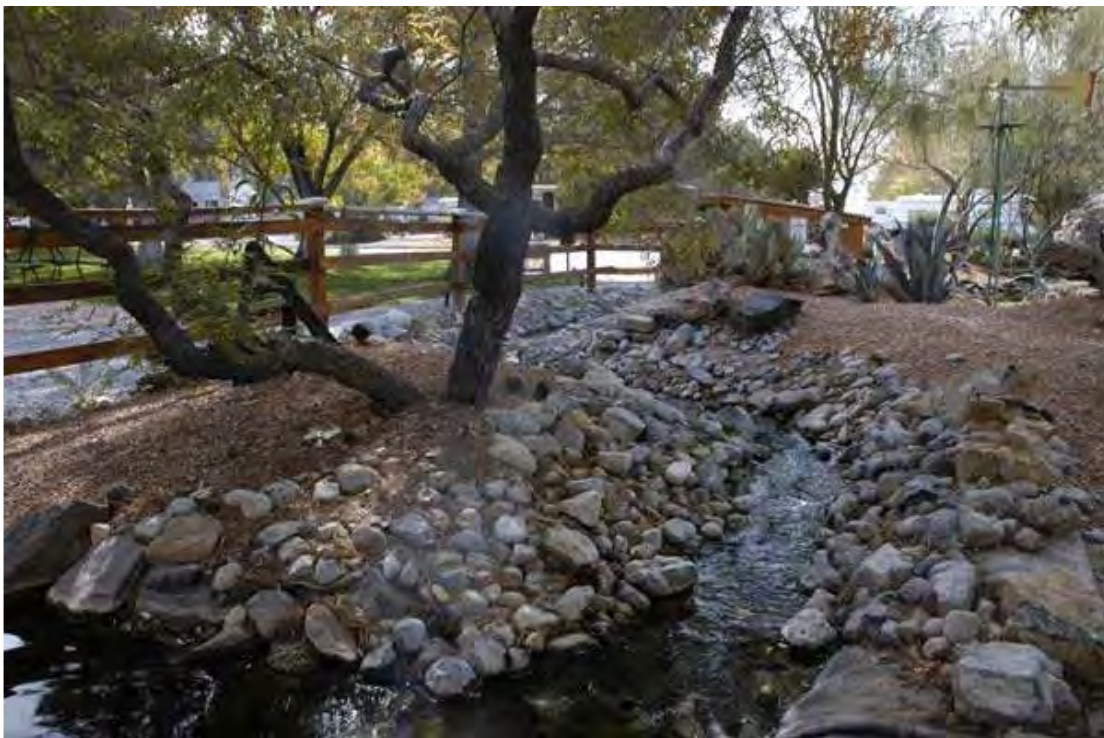
Not a lot of grass to cut.