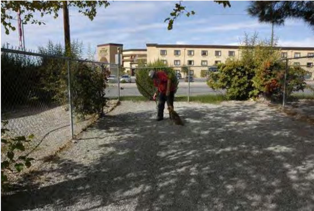
Percy found a place to play!