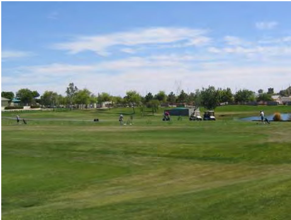
Here are some views of the Viewpoint 18 hole course