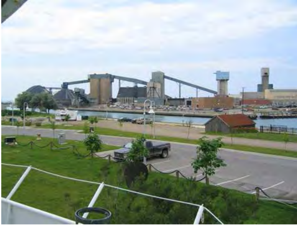
Outside we admired the view of the harbour