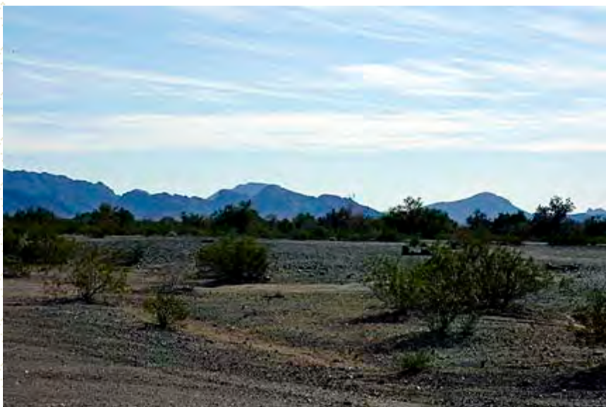
Clouds of every type floated overhead.