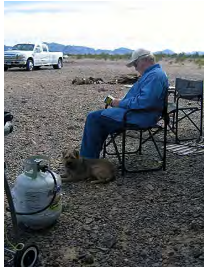
The sky seems to be really big out here.