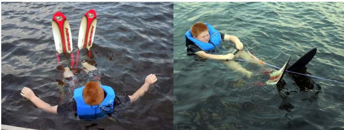
Hang on tight.