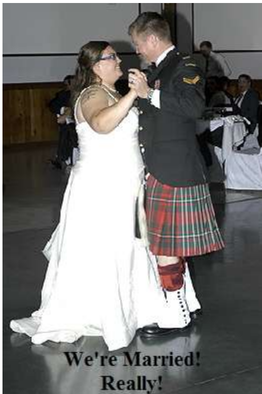
We're Married! Really!