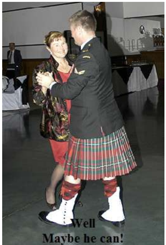
Well Maybe he can!