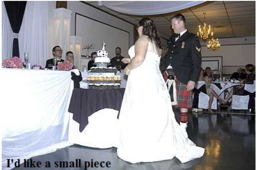
I'd like a small piece