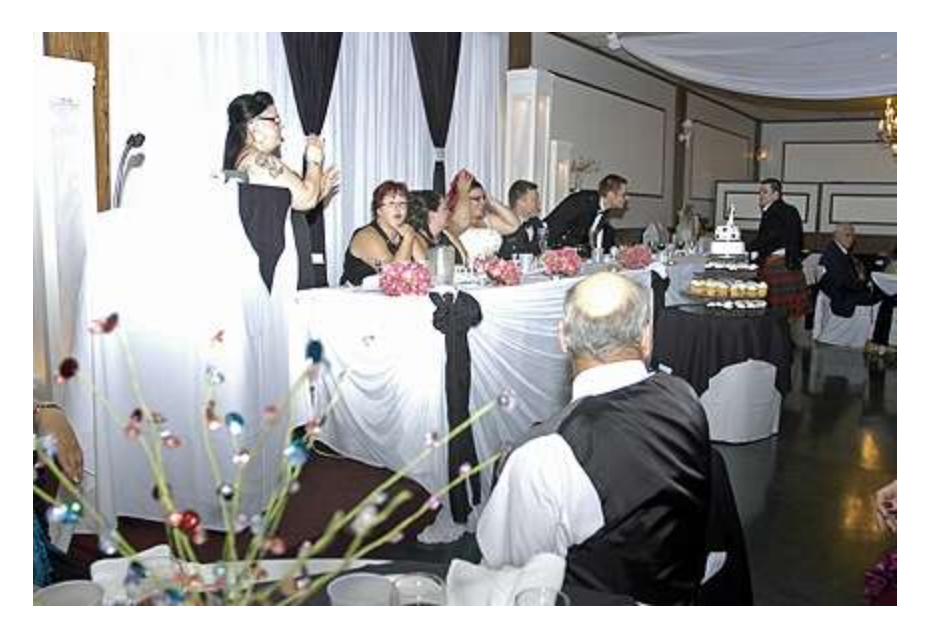
After a fantastic smoked turkey dinner and cutting the cake the dancing began.