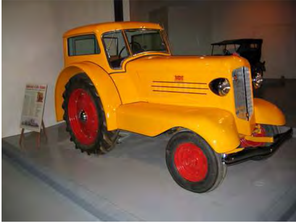
This is a tractor from the 1930s