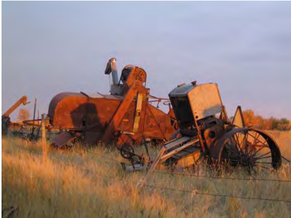
Through our picture window the sun put on a marvelous colour show