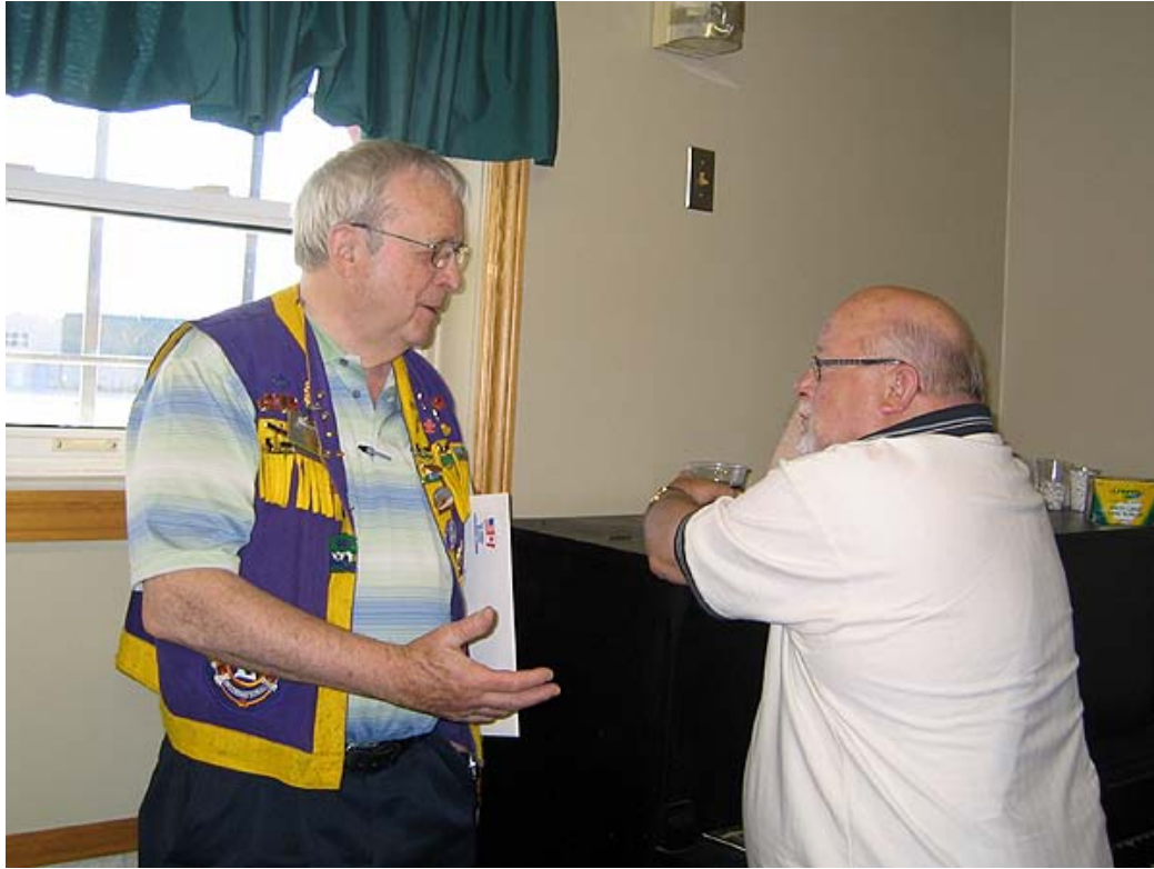
Before dinner PDG Lion Mike led everyone in a sing-song