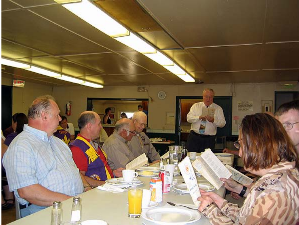
After Dinner Lions shared some stories.