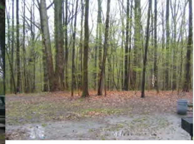
Back at the campsite, it was a muddy mess.

When we got back to the park we took a ride down to the Mississippi river but could not get there, as the water was over the road.