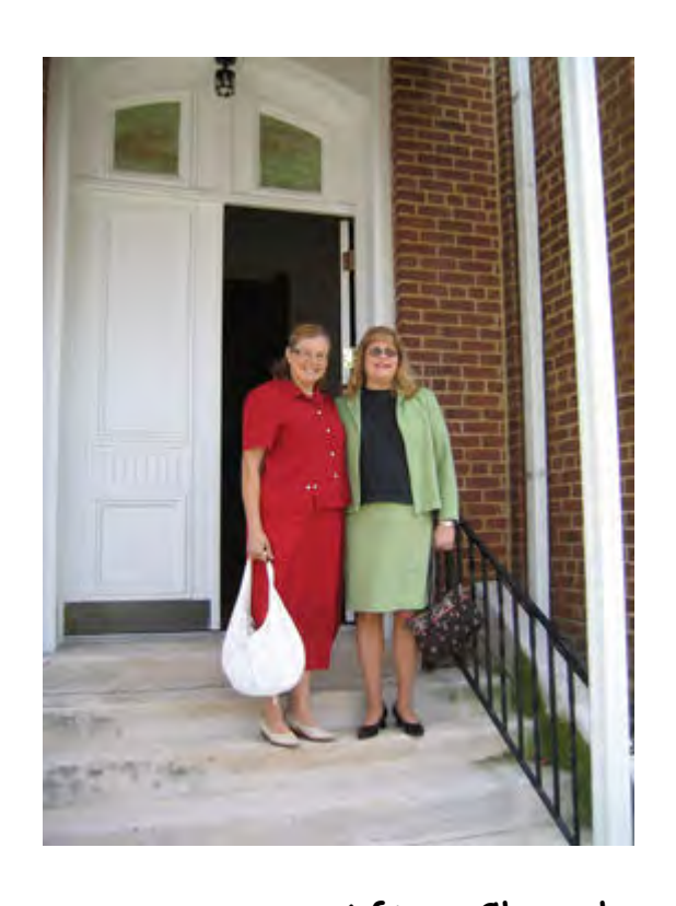
After Church we went out for lunch. One of the wonderful Church Parishioners picked up the tab. Many thanks to the generous and kind people that we have met in Tennessee.