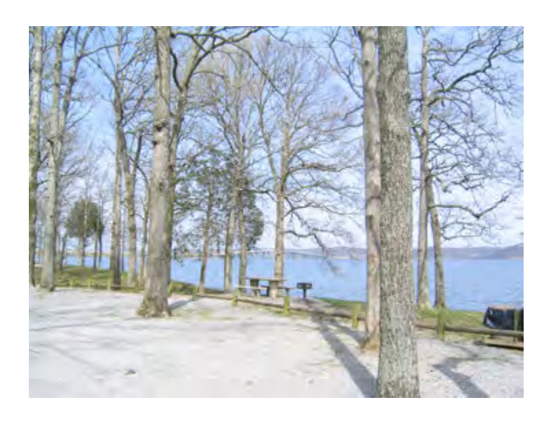
The bridge to Land Between the Lakes

The sun was shining again so we drove out to Piney Lake Park and admired the great campsites, most of which are too small for our rig.