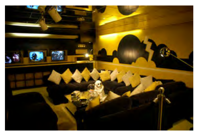
The TV room was Black and Yellow with lots of chrome and mirrors.

The pool room walls and ceilings were covered in a wild red, blue and gold fabric that matched the lights.