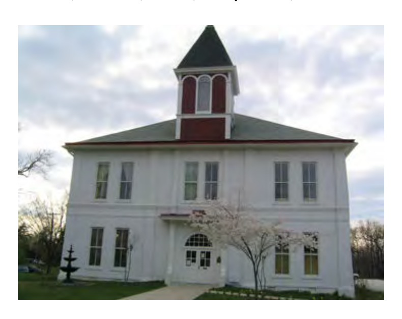
The County Building