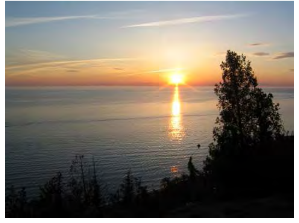
Not too many good sunsets due to the cloudy skies.