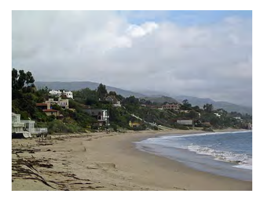
We did, however, enjoy an earth shattering lunch at the Paradise Cove Beach Cafe. This quaint little spot was full of people enjoying the view despite the on again off again rain showers.