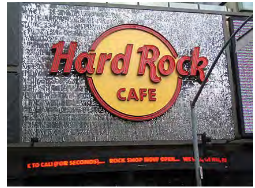
And of course the Hard Rock

There were crowds of people, some wearing outlandish costumes, in front of Gruamans Chinese Theatre