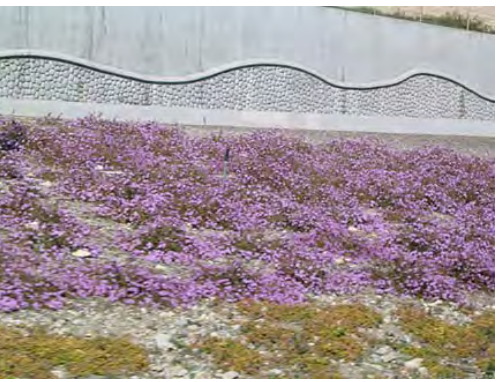
traffic and bumps. Welcome to California! We did see some pretty flowers on the roadside.