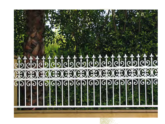
Then it was on to Sunset Boulevard