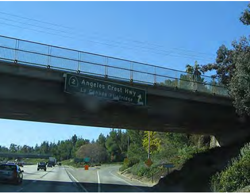
Getting closer to Los Angeles. Due to all the recent rain the countryside is quite green.

Did you catch what else was on that sign above?