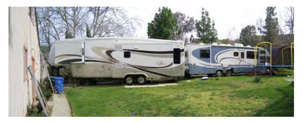
The backyard is very secluded with hills and trees all around.