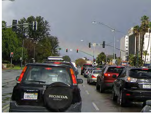
And many amazing residences in the high rent district on Rodeo Drive.