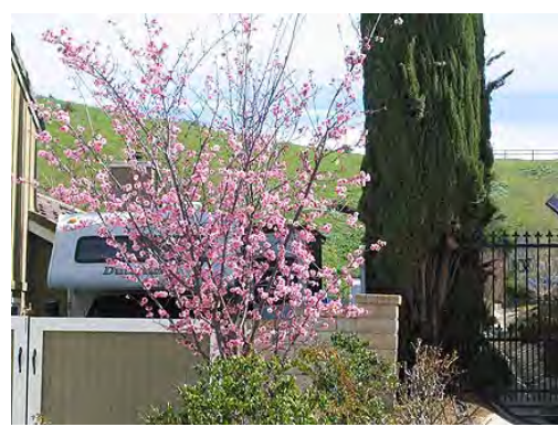
It is springtime in California. The roses are greening and bushes are flowering.