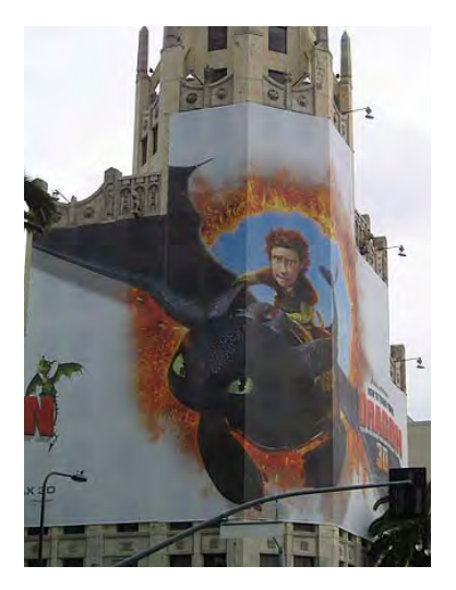
Dave managed to find a parking spot and we walked for a few blocks to see the sights up close