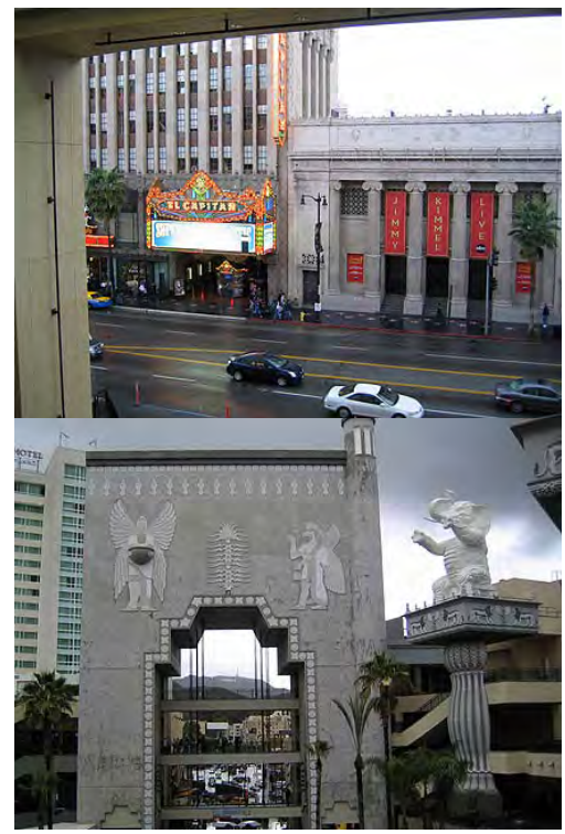
behind the theatres there was an interesting open air food court where you could see the famous HOLLYWOOD sign in the distance.