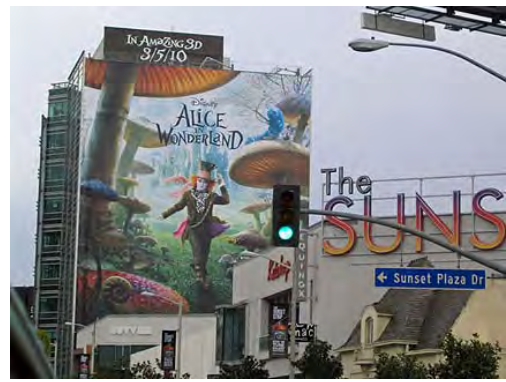
The bill boards were bigger than life

Many unique businesses lined the busy street where "cruising" is strictly forbidden.