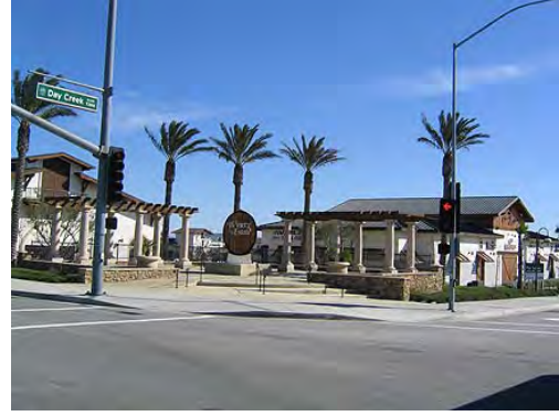
Passed a fancy Winery Estate