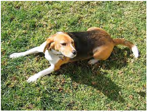
Lucy is a Beagle