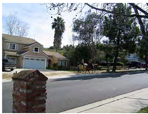
They live in an Equestrian Community. Most of their neighbours have horses in their back yards. One side of each street has sidewalks while the other side is a sand path for the horses.

Our host is the brother of a good friend back in Ontario. He and his wife have a large property with lots of room, but the gate to the back yard is only a few inches wider than the Suite, so we had quite a time getting parked. The tree over the gate needed a bit of trimming as the suite is also taller than their RV.