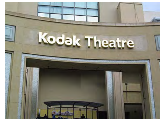
The Kodak theatre (home of IDOL) right beside Graumans