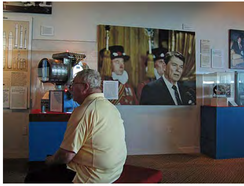
Watching one of the many excellent films