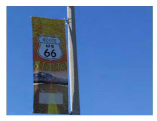
Stopped for fuel on Cherry Blvd where the Diesel was a bit less expensive than most stations.