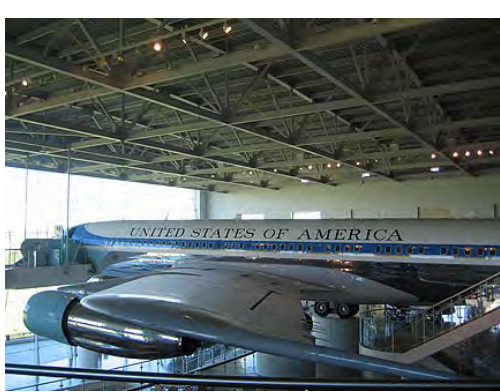
Views from the outside