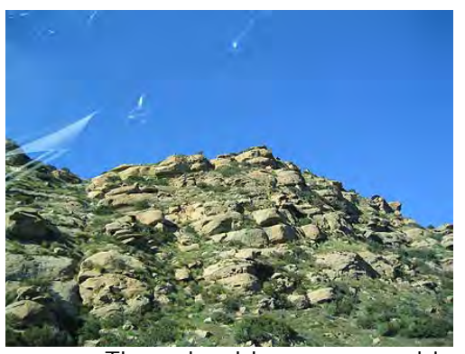
These boulders sure are big