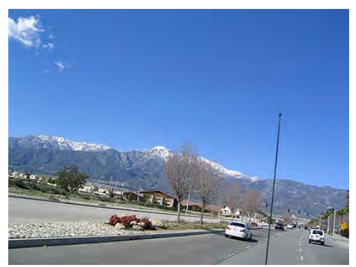
More white stuff in the distance