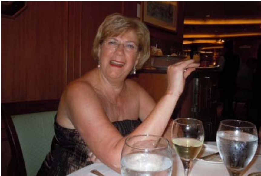
Dinner included lobster and giant scampi.

For dessert the lights were turned down and all the waiters and chefs brought in the Baked Alaska.