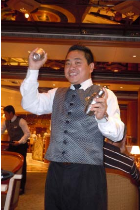
The evening was rounded out with a nightcap at the Skywalker`s Lounge.