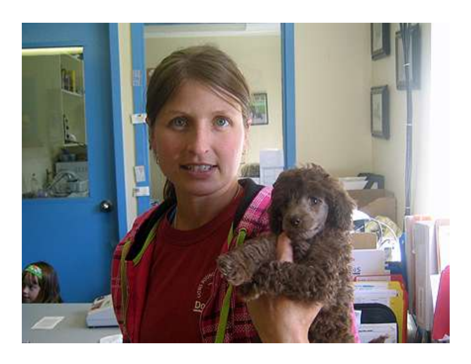
His name is "Investment by Dundee" but we are calling him Indee.