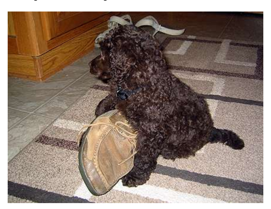
Here he is looking like a little angel.