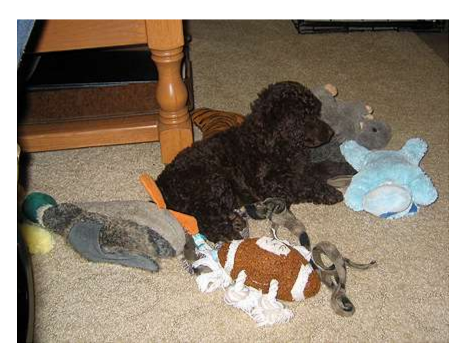
He also found some shoes that looked interesting but he soon found out that foster parents are not pleased when he chews on them.