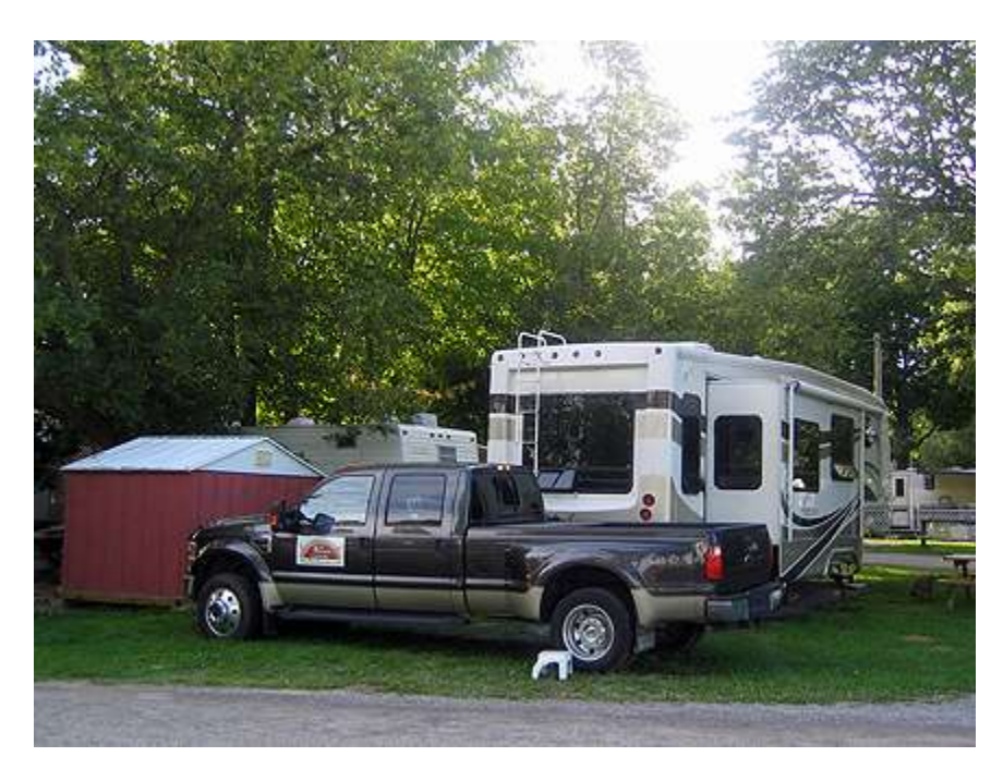
Percy enjoyed watching the kids play in the playground across the street

We left Smiths Falls in the morning, took the back roads east and stopped for the night at a campground near Lindsay. Our site was a pull through near the front gate. Perfect for staying just one night.