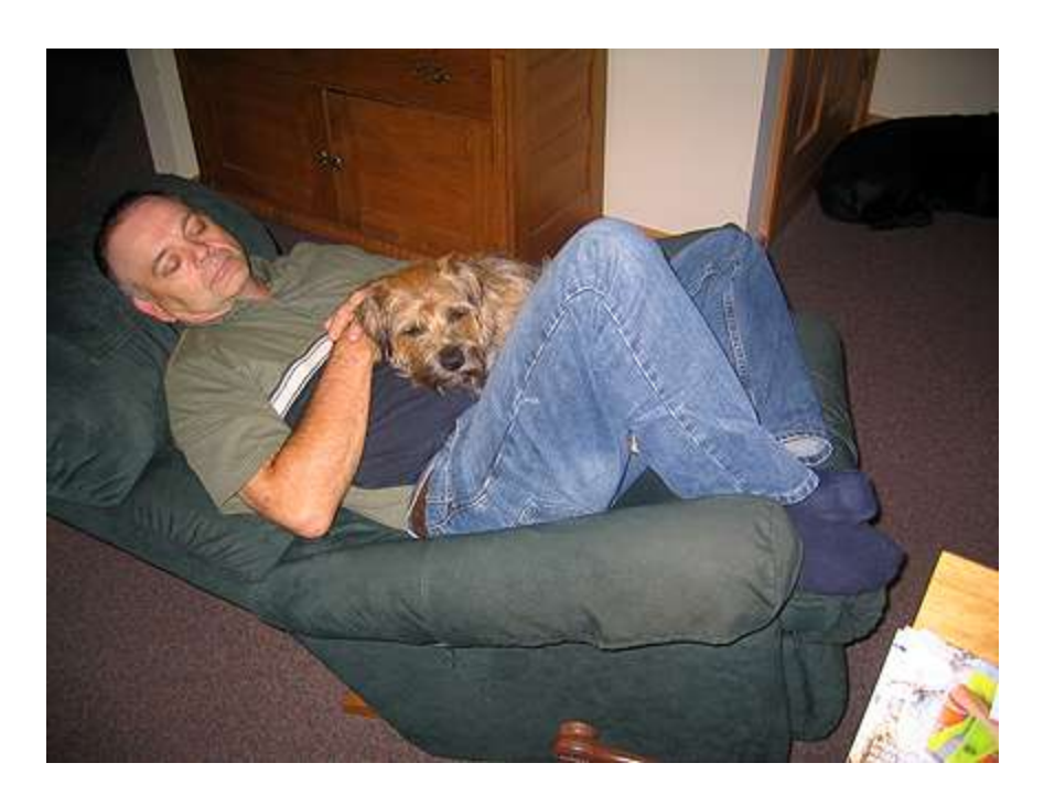
The gathering was smaller than usual and we certainly missed the Lions who could not make it this year, but the food and fun was great as usual.