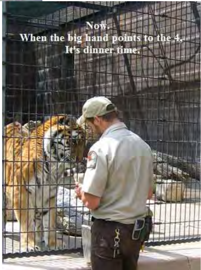
Now, When the big hand points to the 4, It's dinner time.