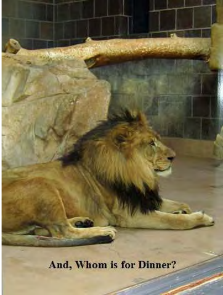
And, Whom is for Dinner?