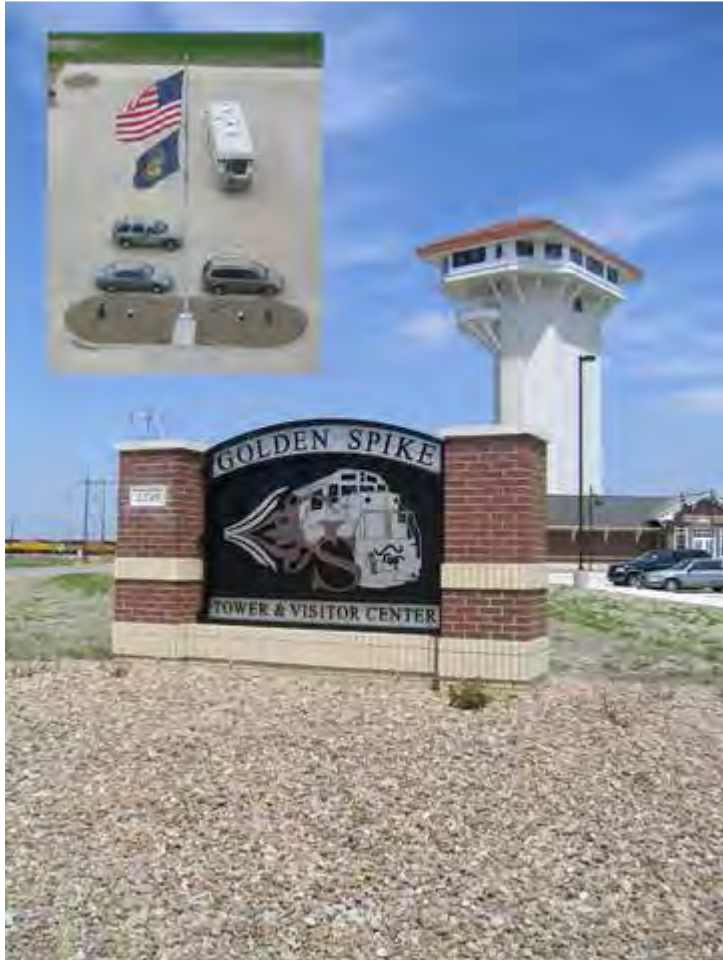
Inside, on the first floor, we saw memorabilia, maps and model trains.