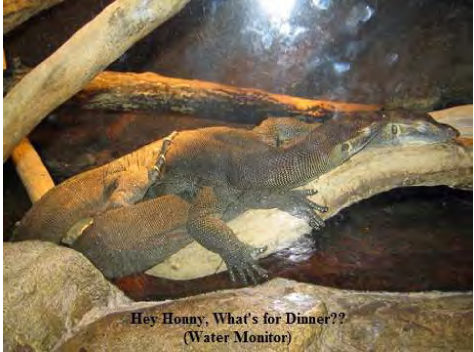
Hey Honny, What's for Dinner?? (Water Monitor)