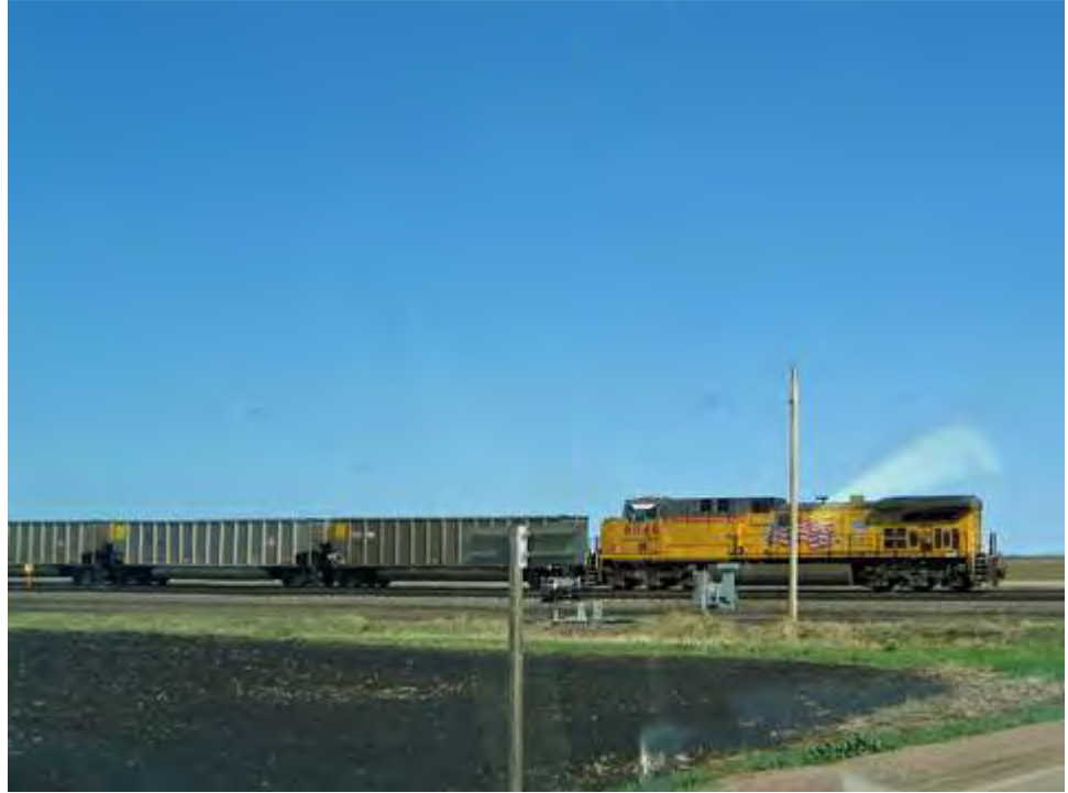
The land flattened out as we neared the river again.