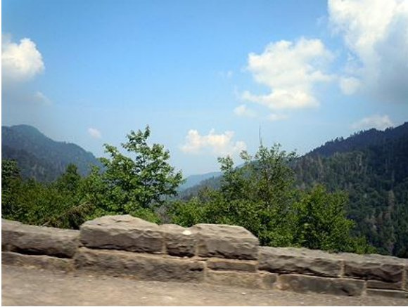
The mountains had a smoky look to them