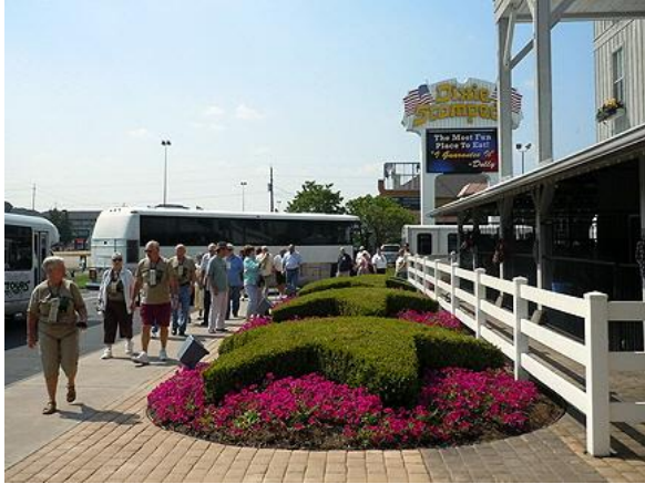
After a long wait we enjoyed some pre-dinner entertainment in the "dry" bar.