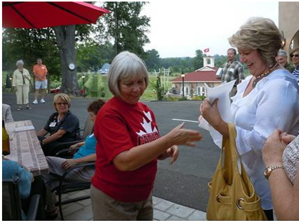
Time for food