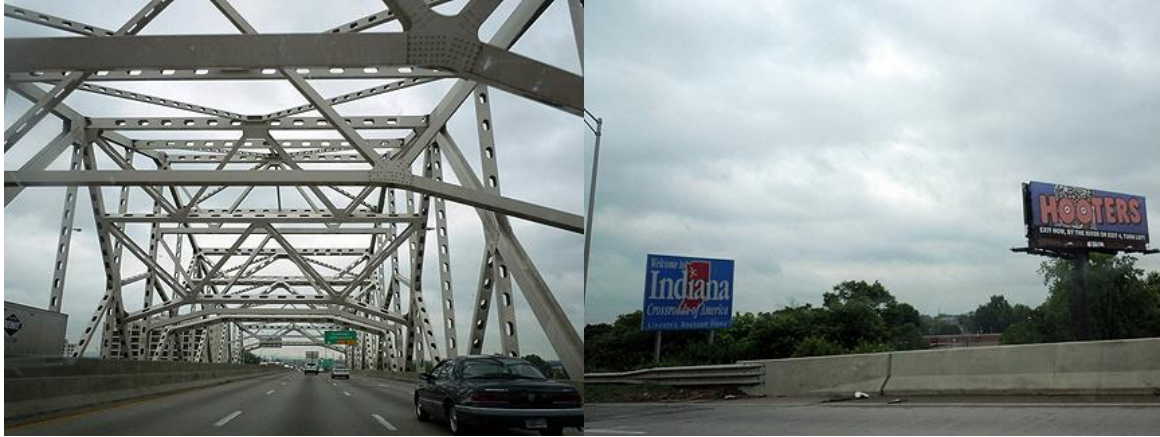
Welcome to Indiana