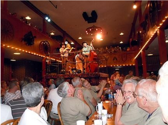
The meal and the show were excellent with lots of horses, dancing and singing and even some live buffalo.