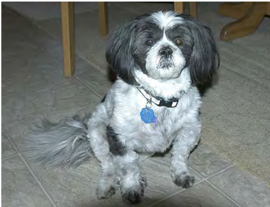
Max looking sweet and innocent